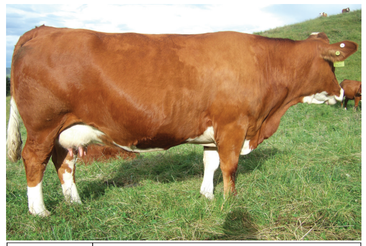
LOT 32 RUAVIEW HONOR SIMMENTAL