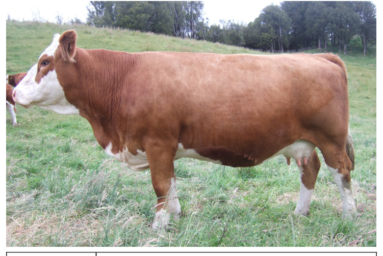
LOT 10 RUAVIEW PAULETTE SIMMENTAL