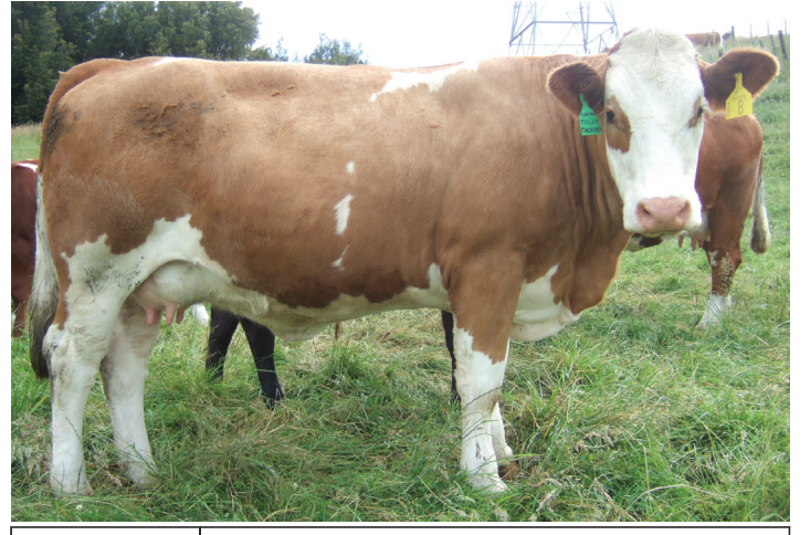
LOT 40 RUAVIEW HESTER SIMMENTAL