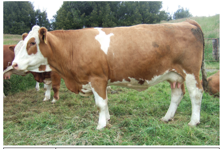
LOT 29 RUAVIEW MICKY 180005 SIMMENTAL